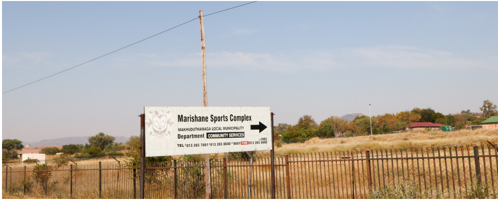
Residents of Ga-Marishane and surrounding villages have to fork-out R200-00 payment fee to their municipality before using the public sporting facility.