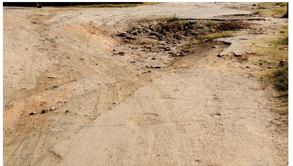
Residents of various villages in Ngwaabe area, Fetakgomo Tubatse Municipality, are concerned about the deplorable state of their main road.

GA-MAEPA - The D4239 Provincial Road, meant to link Ga-Maepa, Mphana, Ga-Maphopha and Ratau Villages in the Ngwaabe area, Fetakgomo Tubatse Local Municipality (FTLM) Ward 29, has deteriorated into what residents call 'a stretch of craters with tar in between'.