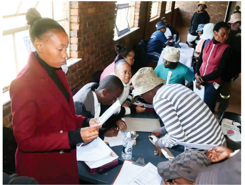
Scores of young people from Roossenekal and surrounding areas were exposed to different opportunities offered during the Youth Outreach Programme.

ROOSSENEKAL - The Office of the Mayor in Elias Motsoaledi Local Municipality (EMLM), through the municipality's Youth Desk, brought a dynamic Youth Outreach Programme to the community of Roossenekal in EMLM Ward 30.