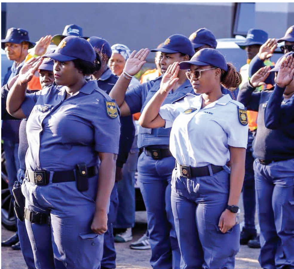
Dozens of police members from across Limpopo converged at Mogorwane Village to pay tribute to retiring Limpopo Provincial Police Commissioner, Lieutenant General Thembi Hadebe

Ward 29 residents are now calling on Fetakgomo Tubatse Local Municipality and Limpopo Roads Agency to urgently re-assess the D4239 and complete the Maseven bridge before the next rainy season. Attempts to get comment from Roads Agency Limpopo at time of publication were unsuccessful.