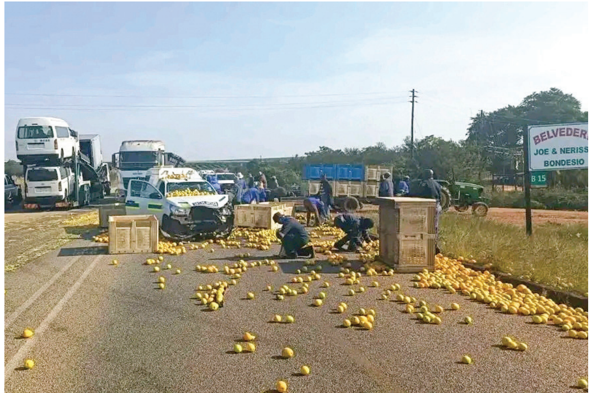
A police member and three awaiting trial prisoners were seriously injured after a police vehicle collided with a tractor on the N11 Road outside Groblersdal.