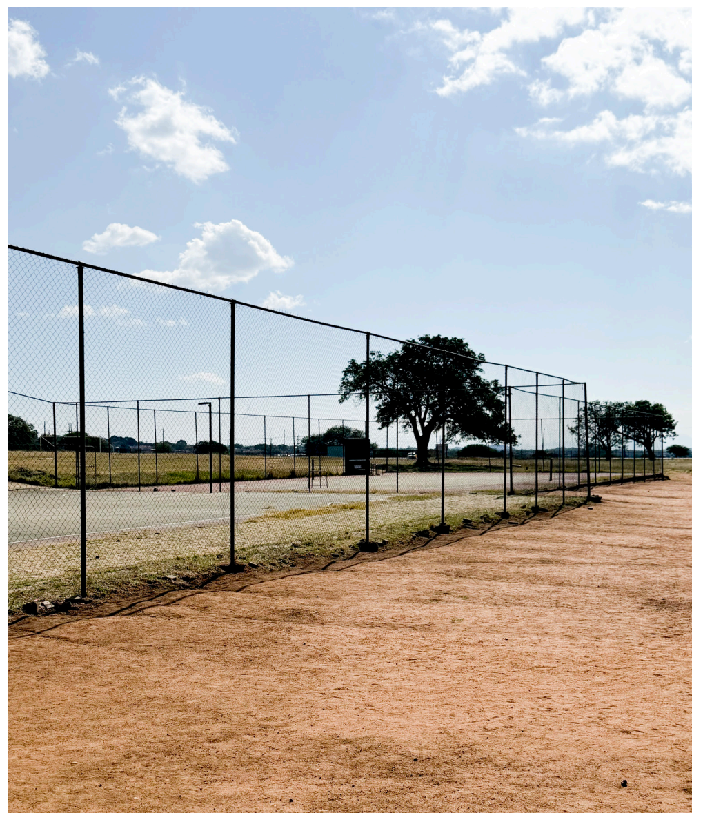
Marishane community constructed a tennis and netball court.

MLM has not yet responded to the publication's requests for comment.