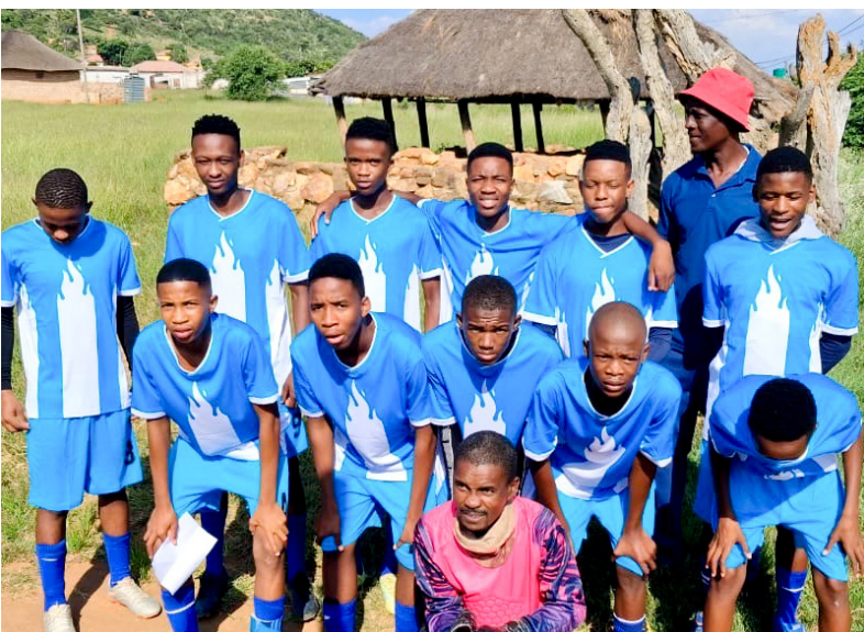
Dikwena FC from Ntwane Village in Dennilton is determined to be competitive in the ongoing Elias Motsoaledi Zonal League.