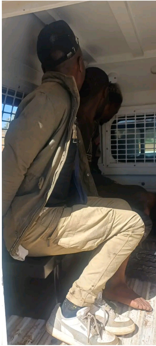
The police have arrested suspects in relation to kidnapping and robbery of a 65-year-old pensioner from Dennilton.

Lieutenant General Thembi Hadebe, Limpopo Provincial Police Commissioner, praised the team for their dedication and commitment in tracking the suspects across provinces.