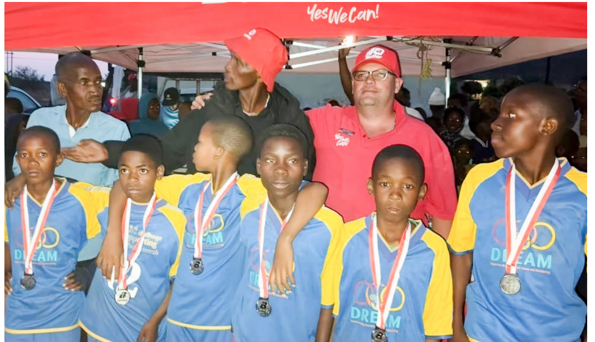
Elias Motsoaledi Zonal League participants, Bricks FC, is eager to grab the first sport in the league.