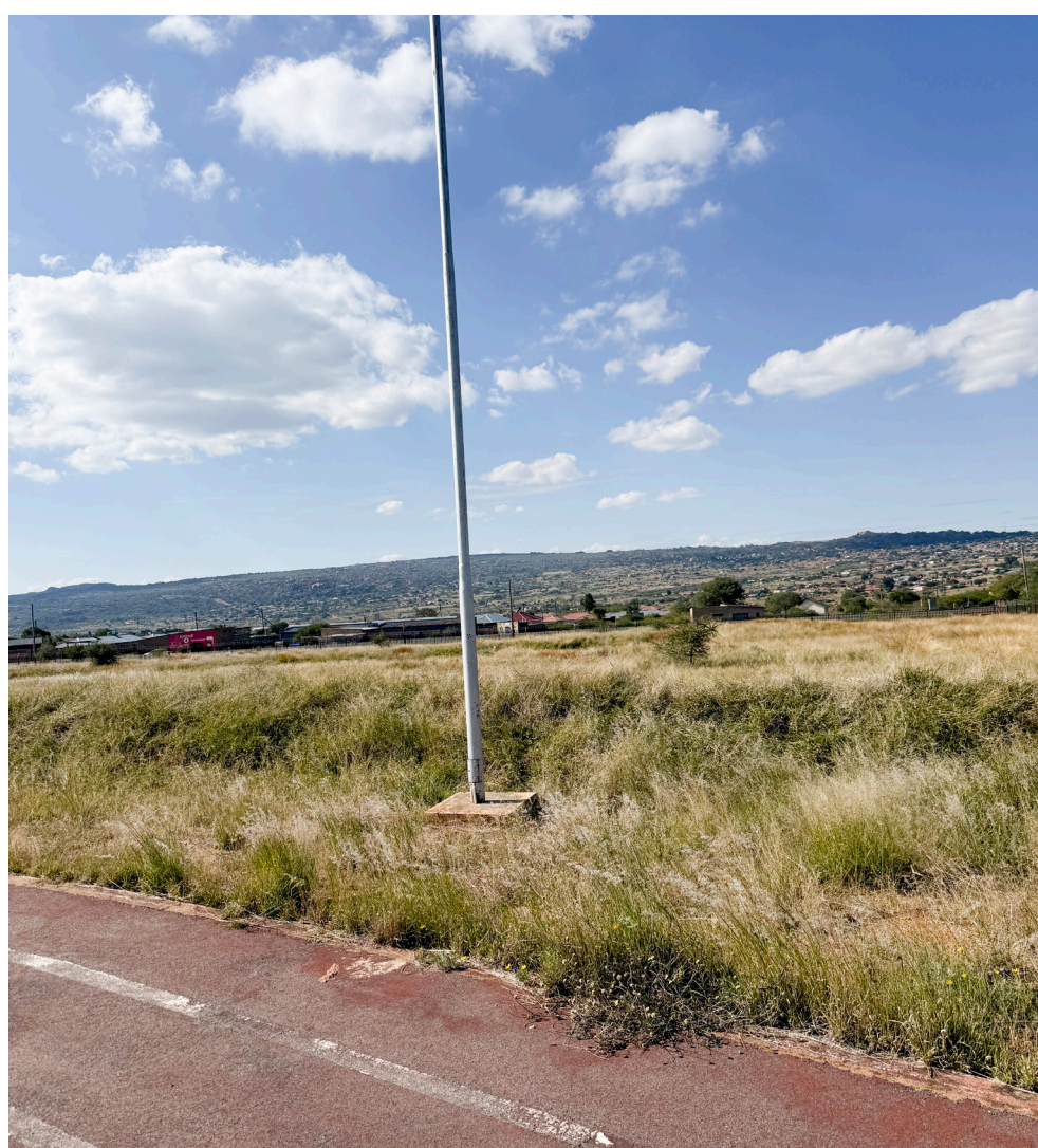
High-mast lights are failing the community

GA-MARISHANE - What was meant to be an upgrade has turned into a barrier for Ga-Marishane residents, who say the Makhuduthamaga Local Municipality's (MLM) new R200-00 usage fee is locking young people out of the very facility the community helped build.