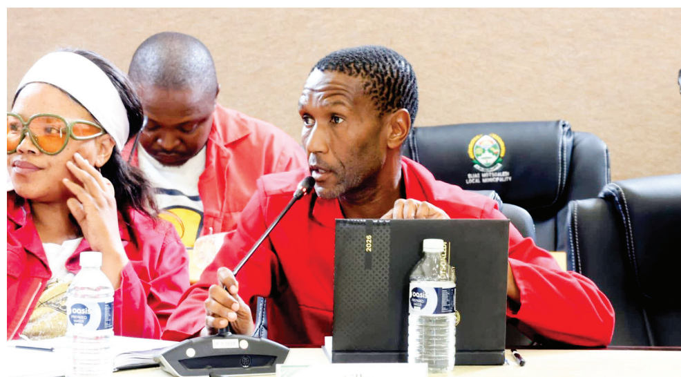
EMLM councillors participating during the IDP special council meeting.